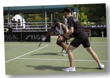
RLI's "The Balding Boys"